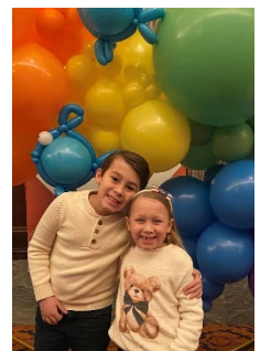
Wangler children pose with lobby balloons