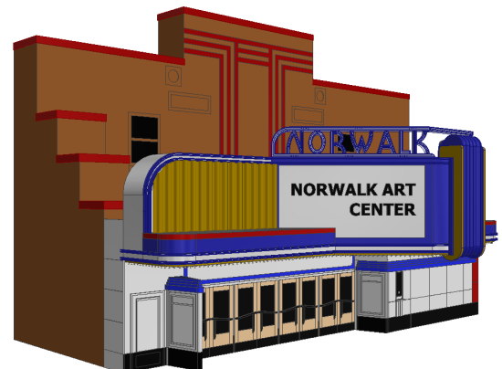
Not to scale* Not for production purposes* Colors are not to hue/accurate*