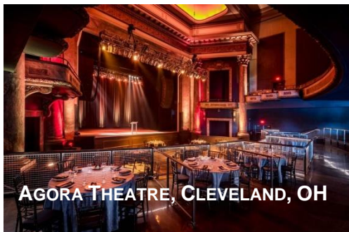
AGORA THEATRE, CLEVELAND, OH

The hope of NAC is to create not just a theater for Norwalk, but a place in which the community can take pride. As we continue the heavy lifting, we envision a facility that will provide space for so much more than just movies. To be successful, modifications will need to happen to make the space a multiform theater. The phased project will begin with the full roof removal and replacement, demo of the ceiling, and removal of seating. Often in a multiform theater, the orchestra floor is leveled and the seats removed to create a large, flexible, flat floor