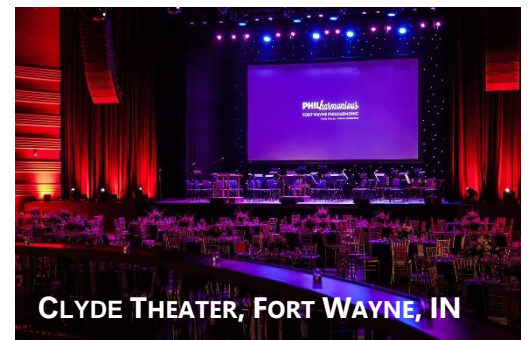
CLYDE THEATER, FORT WAYNE, IN

As a group, we feel strongly and passionate about this project. No luck needed-- just lots of hard work! That is exactly what has been happening since June. NAC has raised over $70,000 towards the much-needed rehabilitation of the theater. In our temporary home at 22 E Main Street we have provided arts education to 100's of children, offered events for the community, spent hours in planning meetings, and collaborated with other non-profits for mutual success. As members of the board, we have attended conferences to learn best practice and created temporary theater space. We have recruited volunteers, who have given countless hours to clean, prepare, sort and preserve the Norwalk Theater.