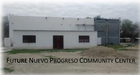
FUTURE NUEVO PROGRESO COMMUNITY CENTER