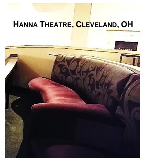
HANNA THEATRE, CLEVELAND, OH

Follow our progress on Facebook/NorwalkArtsCenter