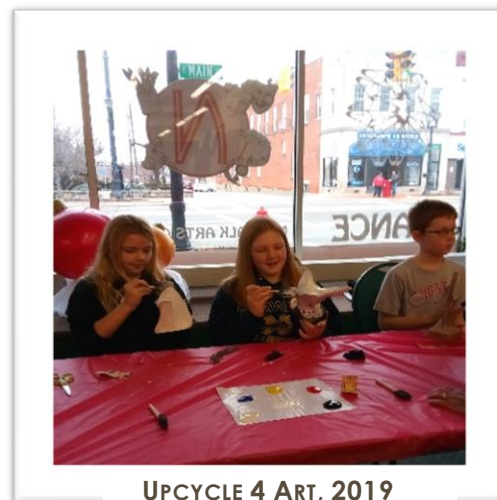
UPCYCLE 4 ART, 2019

Since then, Arts Explorers have developed their creativity with themes like "Arts, Naturally," "Pattern Palooza," "Masked Mayhem," and "Wrapped in Warmth." When in-person sessions could not be held due to Covid restrictions, family mission kits were made available and participants were encouraged to share their creations with NAC via email. Families that shared were then eligible for a drawing for a family activities basket raffled at the end of the session.