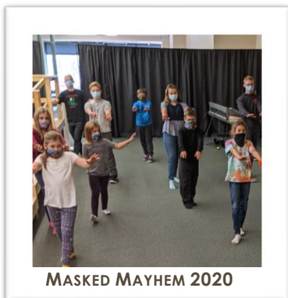
MASKED MAYHEM 2020

The Arts Education Committee also produced the first NAC youth theatre production of Elf the Musical, Jr. in December 2019. Two casts each performed two shows to delighted audiences at the newly-created black box theater at NAC's satellite building at 22 East Main Street. Talent assessments were held and cast members chosen for a spring production of " Peter Pan, Jr. ," as well. That show is on hold until live performances can be held safely again.